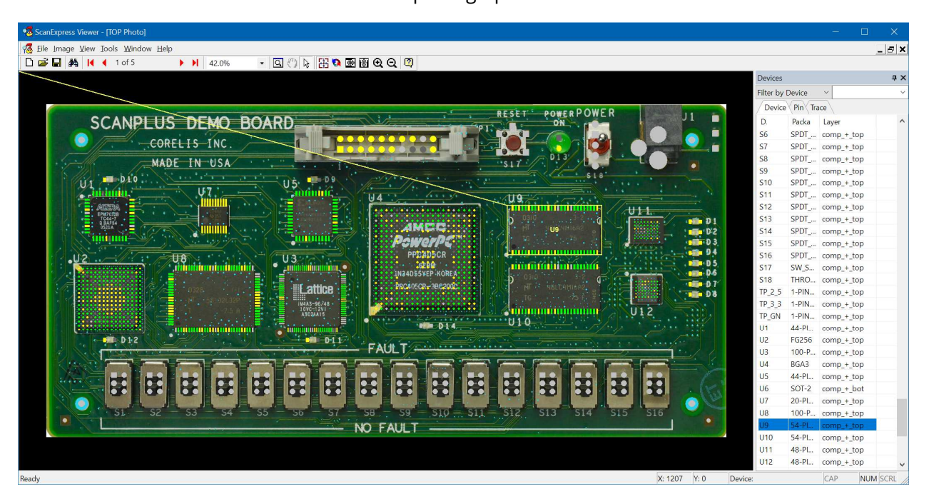
Figure 2. Test coverage data displayed the ScanPlus Demo Board platform.

ScanExpress Viewer can now overlay test coverage data on top of CAD and/or photographs for visual analysis of boundary-scan test coverage. Coverage reports created by ScanExpress DFT Analyzer can be imported into ScanExpress Viewer to color-code pins based on "Complete", "Partial", "None", and "Undefined" coverage classifications. Color-coding is customizable and this feature can be used with or without a board photograph.